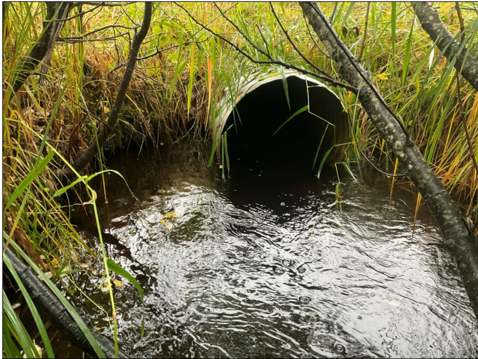
Figure 3.— Culvert at waypoint 1246.