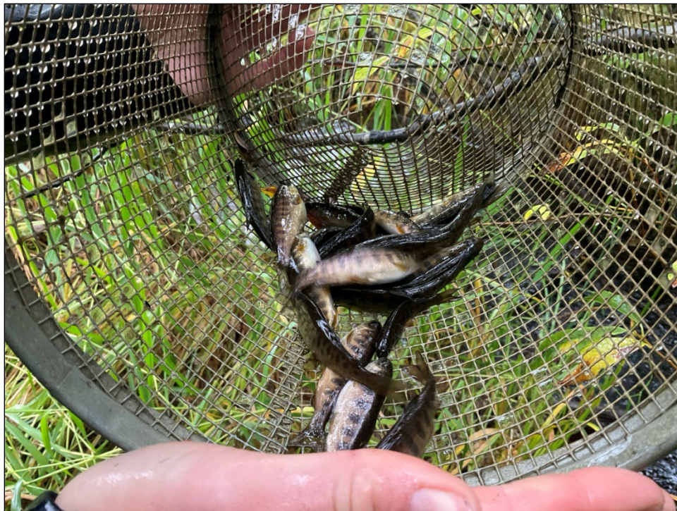
Figure 1.—Juvenile coho salmon and Dolly Varden captured at waypoint 1246.