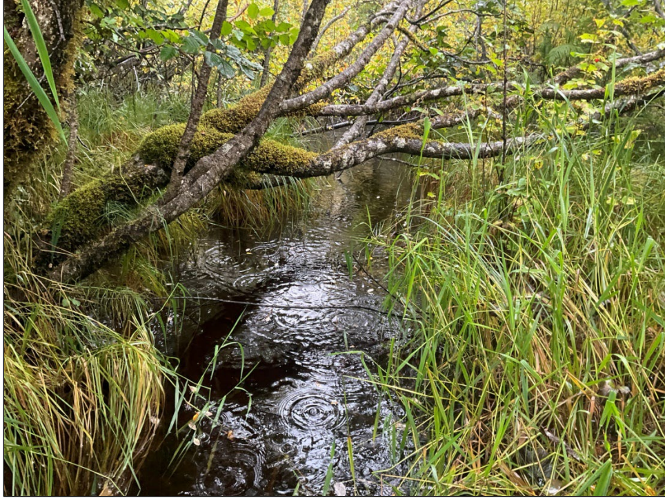
Figure 2.—Stream channel at waypoint 1246.